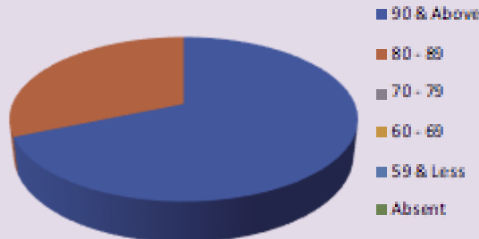
I.S.C. 2021 - ALL SUBJECTS